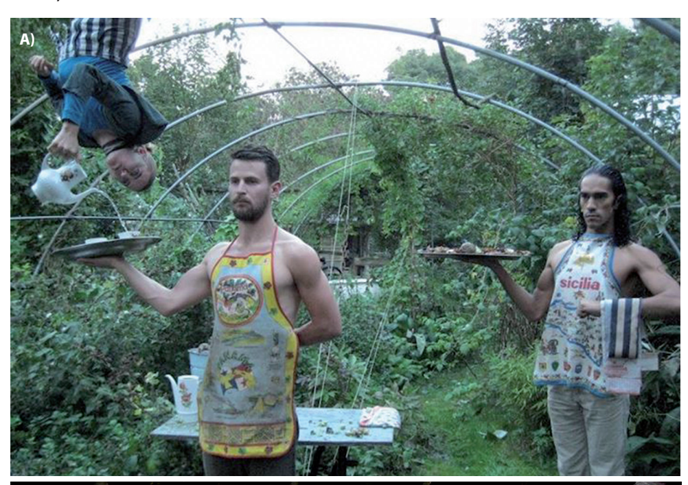
Fig. 4 Artistic inspirations in the city garden spaces: A) Performance, Germany; B) Drawing lesson, Lithuania