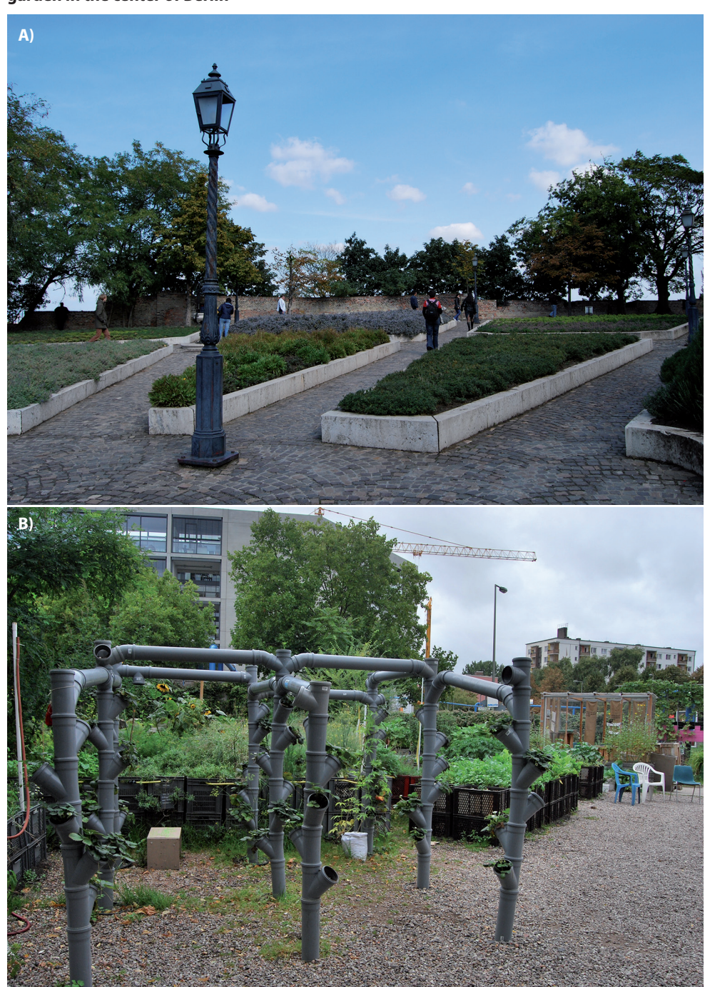
Fig. 1. A) Classical Medieval herb garden in the Old City of Budapest; B) 21st century vegetable garden in the center of Berlin