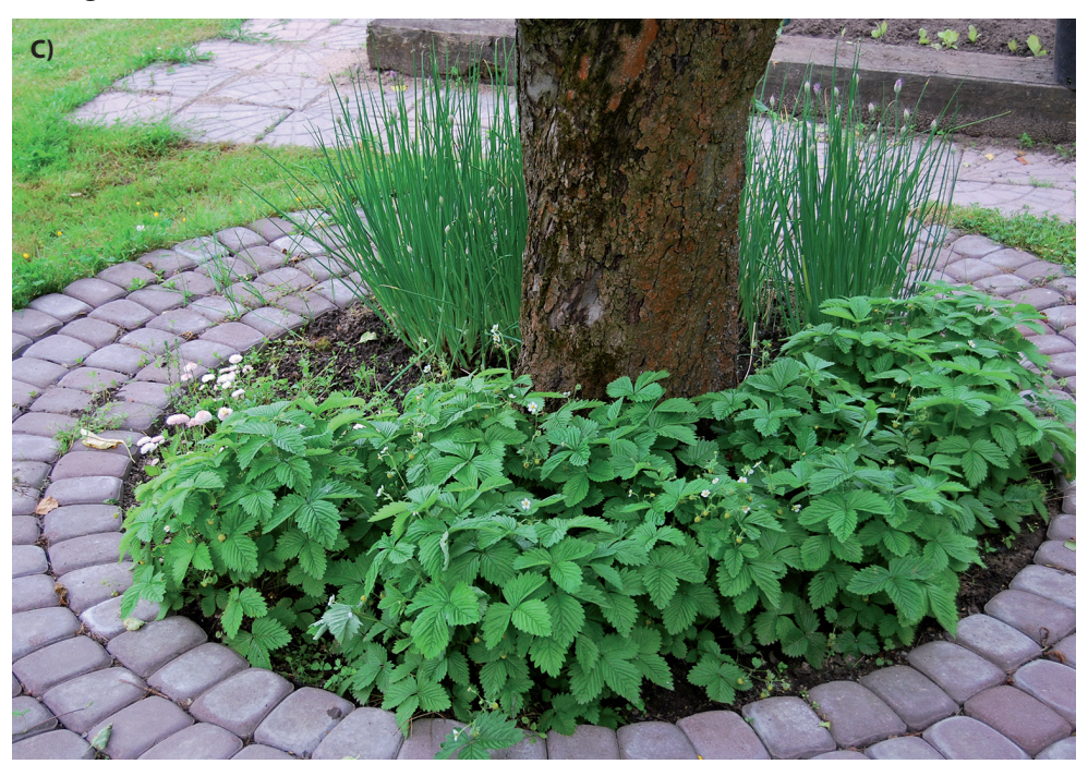
Fig. 2. Possibilities for the use of wild strawberry in the city spaces: C) A place under a fruiter in the garden)

"Window box" – plants are planted in containers fitted onto window sills. This creates an illusion of domestic life among the plants in a green space when viewed from the inside of the building, and is an additional decoration to the exterior of the building.