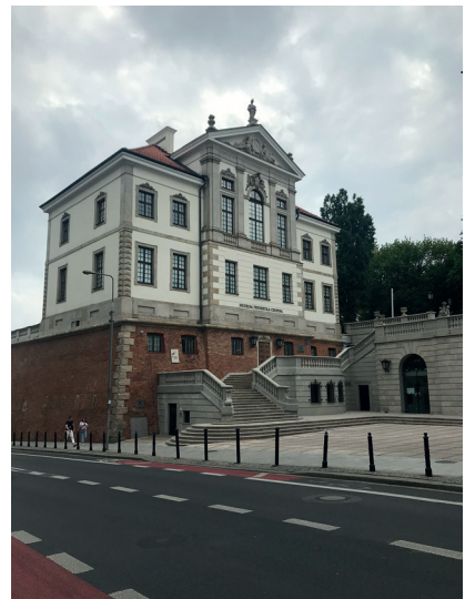
Fig. 15. Ostrogski Palace, Chopin Museum in Warsaw