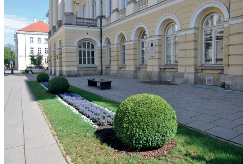
Fig. 9. The multimedia Chopin bench in front of the Kazimierzowski Palace at the Warsaw University Campus

Another question about the uneasy relationship between the 'high art', mass consumer taste and commercial interests might arise. There will always be a threat of popular culture somehow absorbing 'high art' and changing it (e.g. the high-quality music of Chopin festivals) into mass production. Moreover, such a tendency could be developed and tolerated with the best intentions (being seen as an excellent chance for local community development and urban regeneration). What's even more terrifying is that the mass culture might destroy a Chopin myth, when it is used as a cynical tool for commerce. The extent to which this compromises and harms artistic integrity of Chopin's masterpieces is, as we are afraid, rather debatable. Realistically speaking, we have to admit that it is difficult to conclude how far the 'high art' could be defined by its market value, rather than by its aesthetic appeal. Considering the number of tourists visiting Warsaw in 2010 (which was not very different from 2009) it did not seem to be the issue. Quite the opposite: the economic outcome of 'the Chopin Year 2010' might still be disputable [McKercher, Du Cros 2002; Page, Hall 2003; Panasiuk 2013; Rhodri 2009; Richards 2007].