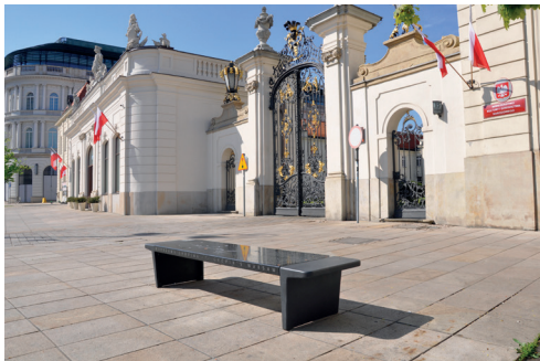
Fig. 3. The multimedia Chopin bench in front of the Potocki Palace