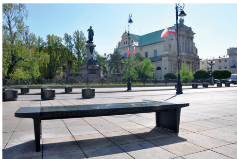
Fig. 5. The multimedia Chopin bench, by the Wessel Palace, with the view of the statue of Adam Mickiewicz