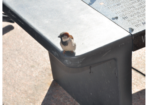
Fig. 7. A sparrow on the multimedia Chopin bench at the Castle Square

pin's Festivals), then the possible visitors are even ready to travel for significant distance to attend it. It means there is a chance for meaningful development of art tourism. It should be considered as a very important and a highly beneficial tendency for society. 'Culturally inspired' tourists constitute a significant part not only in economic terms but also in a much broader context of possible advantages (promotion of the city and region, education and culture).