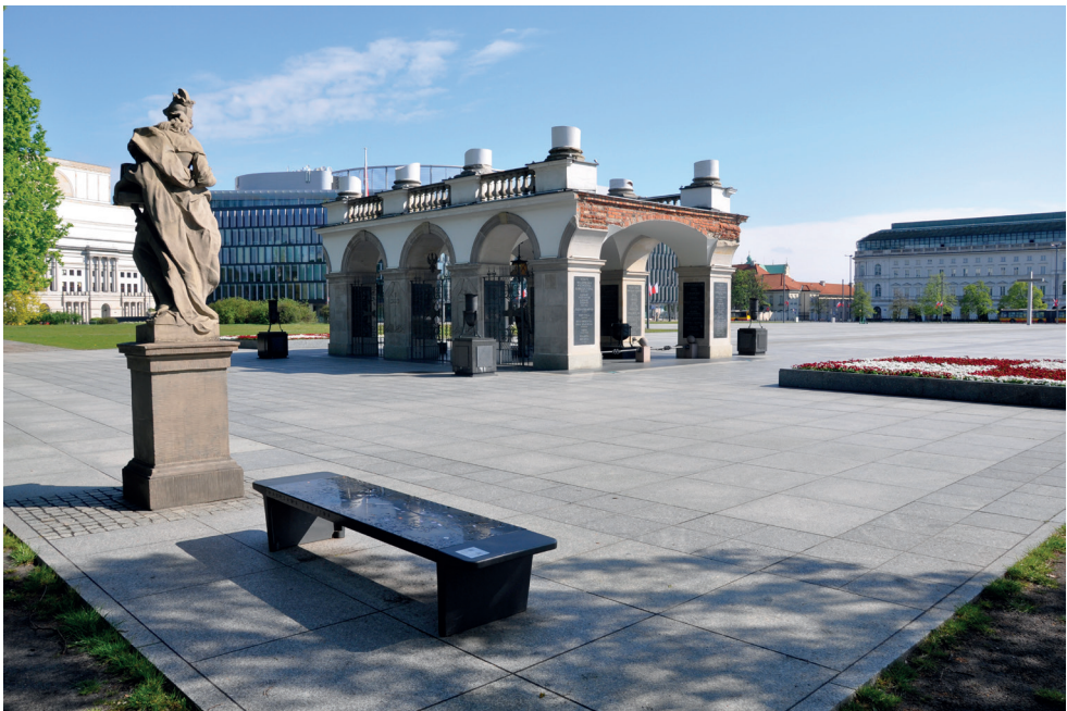
Fig. 2. The multimedia Chopin bench at the Pilsudski Place near the Tomb of Unknown Soldier, by the ruins of The Saxon Palace

they were supposed to be available to all: the local community and tourists visiting Warsaw for other than these cultural events reason. They were organised to attract both music lovers but also people without special musical experiences. These important 'Chopin Year 2010' celebrations were aimed broader rather than to satisfy a narrow niche of professional musicians. Quite the opposite, they were intended to be widely popular, to draw the attention of numerous school groups from different villages and towns in Poland and also to meet the needs of the residents. Although until recently Chopin festivals were mostly shaped for international guests, on that year also common tourists and local community members were able to participate in many events, which were opened to everybody as free of charge 'street music' projects.