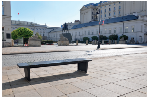
Fig. 4. The multimedia Chopin bench at the Presidential Palace (former Radziwill Palace)