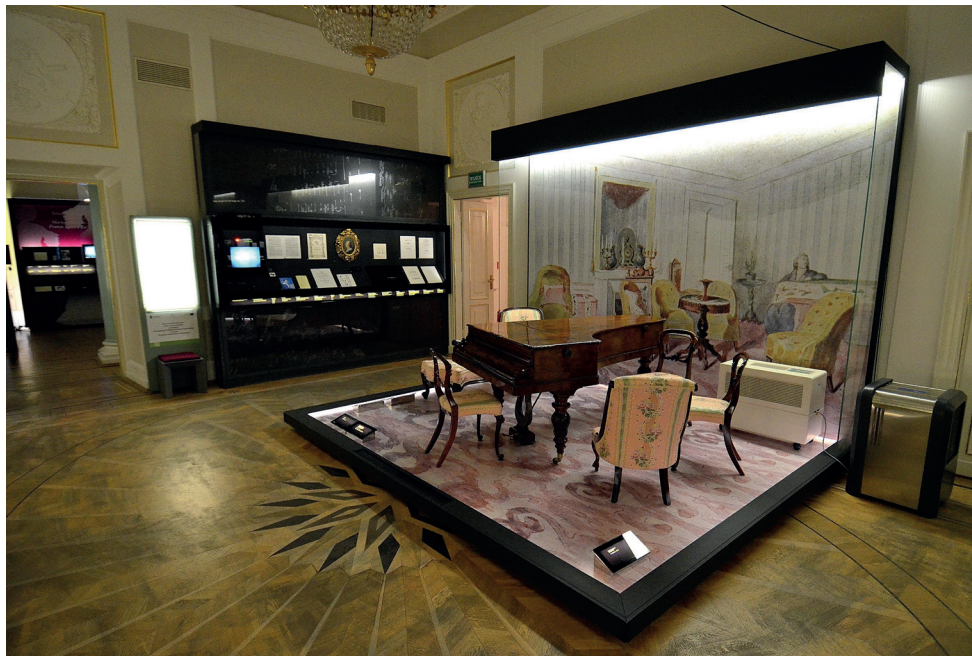
Fig. 16. Fryderyk Chopin Museum in Warsaw. Composer's last piano made by the Playel Company (no 14810). Chopin played and composed on this instrument in 1848–49