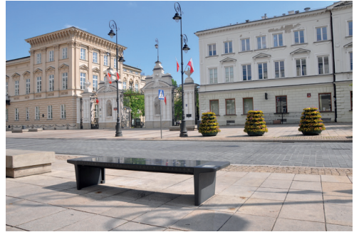
Fig. 11. The multimedia Chopin bench with the view of the Warsaw University Campus main entrance

All in all, 'the Chopin Year 2010' in Warsaw showed how important the cultural initiatives undertaken at the municipal and national level are. It portrayed their role in the revitalisation of urban culture, improvement of everyday urban life and in strengthening the self-esteem of the residents. For the Warsaw community, perhaps, it was the most important that 2010 was filled with many events connected with Fryderyk Chopin. For the first time, they were easily accessible to the locals (e.g. the 'Chopin Multimedia Benches') (Table 1). It was a great achievement of the City Council. It meant that a strategic decision was made to design 'the Chopin Year 2010' for Warsaw citizens, while still keeping the events open for tourists. It allowed the local community members, visitors from other parts of Poland and foreign guests to learn more about Polish culture, Warsaw, the traditions and history – especially about Chopin's connections with the city. Even though 'the Chopin Year 2010' in Warsaw did not appear to attract a greater number of tourists into the city, the locals enjoyed the events, that were being staged in many 'open-air' sites. These were, among others, the newly built 'Chopin Tourist Route' or concerts organised at public green spaces, like the popular summer 'Chopin Concerts under the Willow Tree' with a tradition lasting already for 90 years. This observation