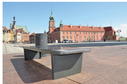
Fig. 6. The multimedia Chopin bench at the Castle Square

To sum up, cultural activities (in the form of art festivals) are widely perceived to have tourism potential. Moreover, if an event is unique and of high quality (as prestigious as Cho-