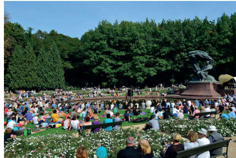
Fig. 13. Concert at the monument of Fryderyk Chopin in Warsaw – ‘Concert under the Willow’

Phot. A. Grycuk, 2014 (Creative Commons Attribution Share Alike 3.0 Poland license, public domain)