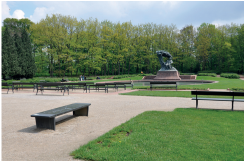
Fig. 12. The multimedia bench with the Fryderyk Chopin Monument in the Łazienki Royal Park

When considering the future strategy of marketing for Warsaw and Mazovia Region as cultural tourism destinations it is necessary to evaluate various issues. Warsaw and Mazovia Region are diversified and their wealth has significant implications on tourist perception. It seems that special attention should be paid to attracting especially high-value visitors (cultu-