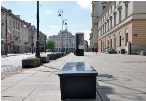
Fig. 10. The multimedia Chopin bench with the view of the Staszic Palace, located by the Czapski Palace

It must be additionally underlined that most attempts of giving 'the Chopin Year 2010' celebrations a more popular character failed (for example, highly criticized cartoons and tacky souvenirs). It means that the values of 'high culture', especially Chopin myth, are recognized as national assets and must not be diminished.