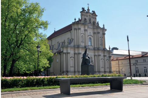
Fig. 8. The multimedia Chopin bench in front of the Church of St. Joseph of the Visitationists and the statue of Cardinal Stefan Wyszyński

for sustainable tourism development. They constitute integral components of the Warsaw lifestyle and are a part of everyday life.